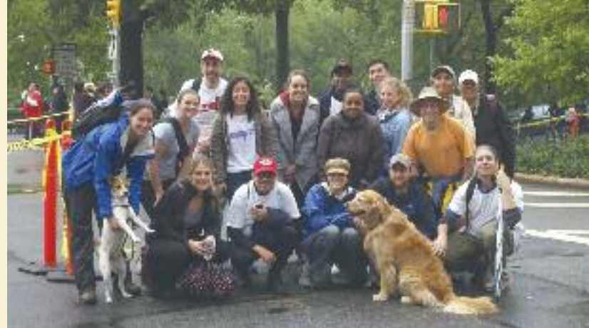
The Camp Viva Team participates in the 2011 AIDS Walk.