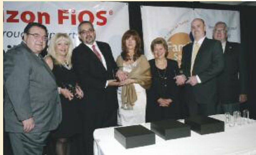
Adoptive families and adoptees were among the "Champions of Adoption" honored at the 2011 STAR Gala.