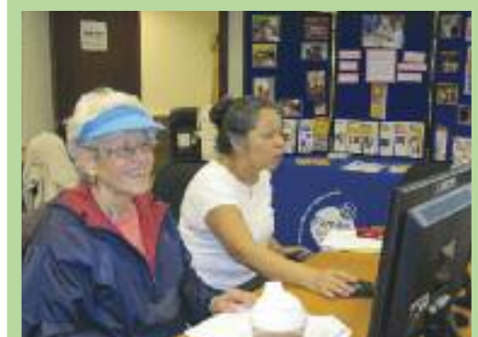
AGING WITH DIGNITY